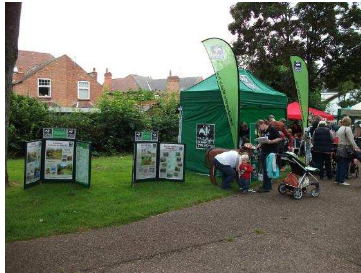
NWT support at 'Lark in the Park'