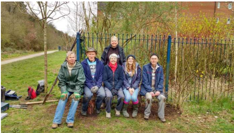
Installation of the new bench at The Green Line (12 March 2017)