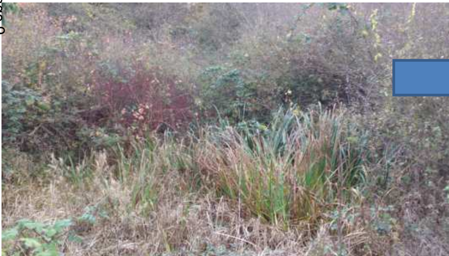
Pond in need of restoration at Stanton-on-the-Wolds Golf Course, Autumn 2017