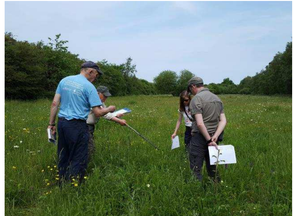
Botanical survey training Skylarks