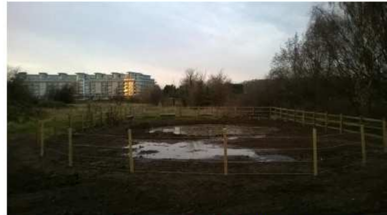
Re-profiled education pond at The Hook (9 December 2016)