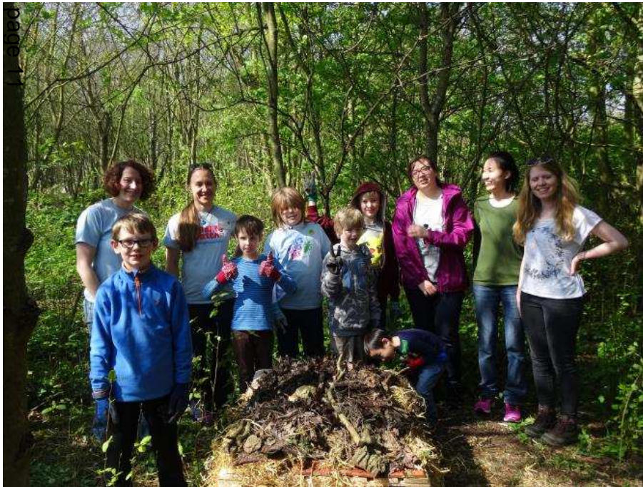
Rushcliffe Watch Group, Bug Hotel, April 2017