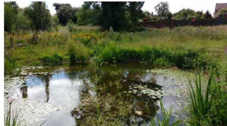
The pond has naturally re-vegetated (1 August 2017)