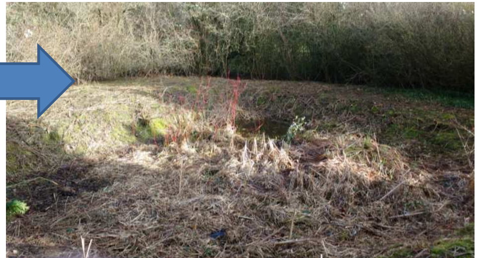
Progress to date (January 2018)